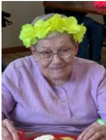
Toots @ The Luau