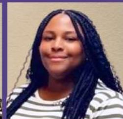
Orchale Culinary Director